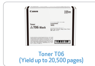
Toner T06 (Yield up to 20,500 pages)

Use of Canon GENUINE toner cartridges helps provide longer equipment life, high yields, reliable performance, high-quality output, and minimal jamming or issues.